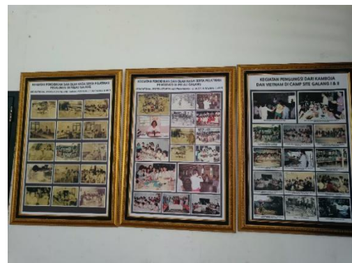
Picture 1. 5 Sports education activities and several activities carried out by refugees

Foreign volunteers play a very important role in helping refugees on Galang Island. Foreign volunteers come from various countries such as North America, Australia, Canada, European countries, and also from international organizations with the aim of providing humanitarian support, and their contributions are very useful in various aspects of the lives of refugees. One of the main roles of volunteers is in the field of education. They provide and build schools for Vietnamese children and teenagers to be able to study, volunteers teach them many things such as teaching English to be able to communicate, and also sports education. And volunteers not only help the education of children but they also organize activities for all refugees.