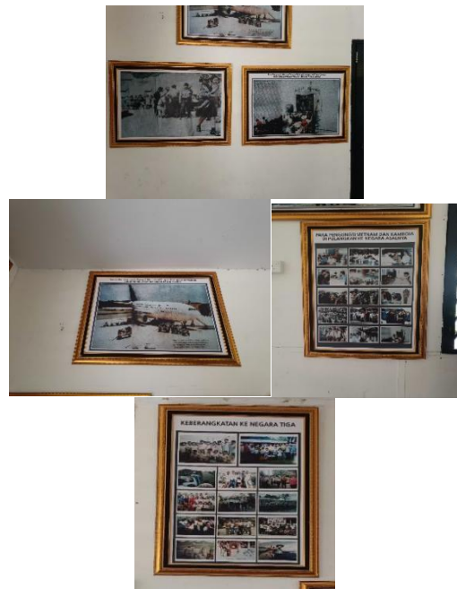
Picture 1. 10 The process of returning refugees to third countries

The refugees have dark memories of an incident experienced by a Vietnamese refugee woman who was raped by several men who were also Vietnamese refugees, which resulted in the woman becoming frustrated and deciding to. to end her life by hanging herself, from this incident a stone ornament of a woman carrying a baby was formed which is to commemorate this event..