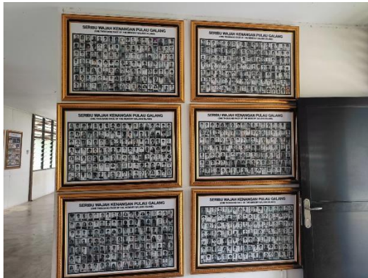
Picture 1. 1 A Thousand Faces of Vietnamese Refugees

Currently, although the refugee camp has been closed, Galang Island is one of the historical tourist destinations in Batam. The former camp is used as a memorial monument to the Vietnamese refugee crisis and is often visited by tourists, including those who want to learn more about the history of humanity in this region. As for Galang Island, we want to trace the traces of history, conflict, and dark memories on the island, where there are some histories that are spread that are not real or deviate from what actually happened there so that there is confusion in the community about the history of Galang Island.