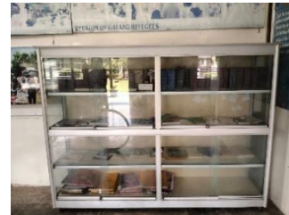
Picture 1. 12 Vietnamese Refugee Relics