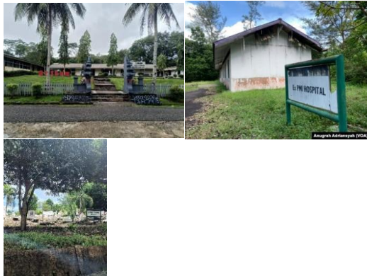
Picture 1. 6 Some facilities provided by the central government and UNHCR (PBB)