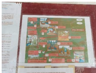
Picture 1. 7 Vietnam Camp Map

There are many volunteers who become teachers and medical personnel for the refugees. They dedicate themselves for the sake of humanity without expecting anything in return. Overall, the role and contribution of foreign volunteers on Galang Island is a reflection of international solidarity in facing the humanitarian crisis, which provides hope and support for thousands of Vietnamese refugees.