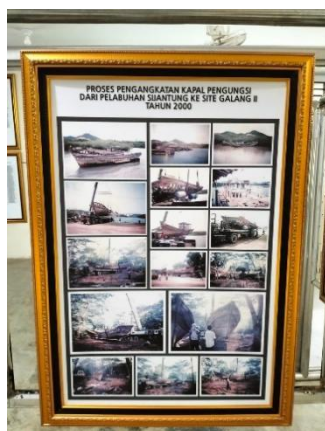
Picture 1. 4 Refugee ship transport process

Initially in 1975 there was a civil war between North Vietnam pro and contra China while South Vietnam pro and contra America. This conflict caused many Vietnamese citizens to flee to various neighboring countries such as Malaysia and Indonesia. At first the Vietnamese citizens fled to Malaysia but because their population in Malaysia was already dense, the Vietnamese citizens finally chose Natuna Island as their next refugee camp. In 1979 the Natuna residents filed a complaint to the Central Government because of the dense Vietnamese refugees in Natuna. The Central Government and UNHCR (UN) decided to establish a Vietnam Camp on Galang Island. And when the Vietnam Camp was established, the refugees gradually came to Galang Island until the refugees reached approximately 250,000 people. They came to Galang Island using hundreds of ships, each ship consisting of hundreds of people in it.