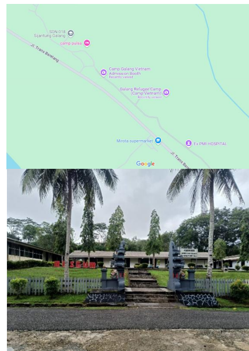
Picture 1. 2 Location map and museum of the Vietnamese camp on Galang Island

Research conducted by the author at Camp Vietnam located on Jl. Trans Bareleng, Sijantung, Galang Island, Batam, Riau Islands, Indonesia. Here is the road map and the Camp Vietnam Museum on Galang Island.