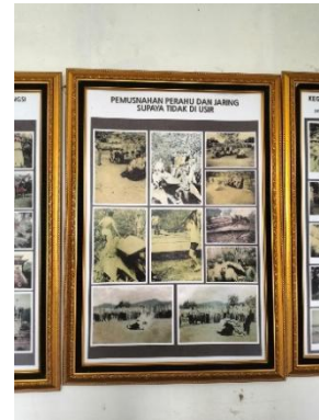
Picture 1. 9 Boat destruction

repatriated to their home country by destroying their boats so that they would not be repatriated to their home country and they also rebelled including burning themselves, hanging themselves, and others that threatened their own lives. because of the many refugees who rebelled, the government, especially the central government and UNHCR (UN) worked with third countries, where. these countries accepted Vietnamese refugees from Galang Island, some of the countries that cooperated were the United States, Canada, Australia, and several countries in Europe.